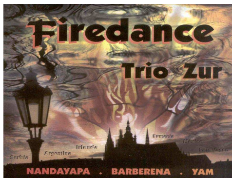
"FIREDANCE" (2006) TRIO ZUR