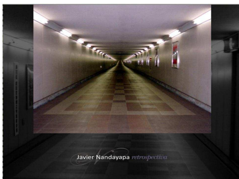
"Retrospectiva" (Retrospective) (2009)