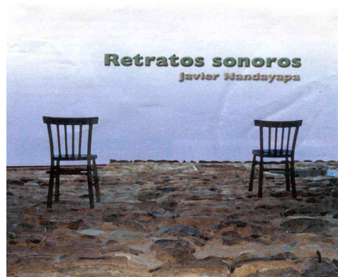
"Retratos Sonoros" / (Sound Portraits) (2004)