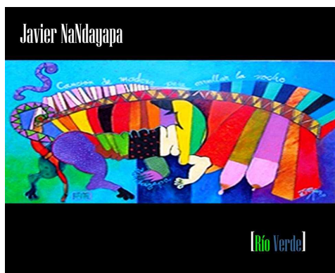
"Río Verde" (2007) (Green River) Mexican contemporary Marimba vol. I