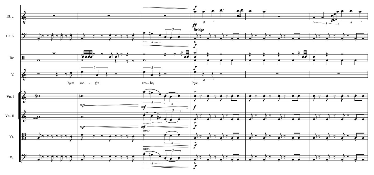
Fig.8. There is a visible electric guitar solo entry, but also a particularly significant drum motif. From bar 48 there is also a change in tempo, which will be maintained until the end of the song, bars 39-51 (source: own materials).

The dramatic, restless tone is interrupted in bar 48 of the tutti, in which the instrumental chorus is introduced with the original, extremely characteristic electric guitar solo in dialogue with the remaining instruments (fig. 8).