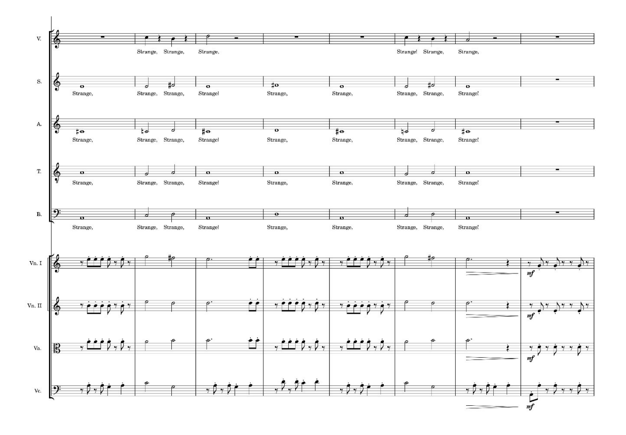
Fig.10. The formal contrast in the chorus is visible when comparing the part of the string quartet (eighth notes, quarter notes in staccato) and the choir (long rhythmic values) bars 65-73.