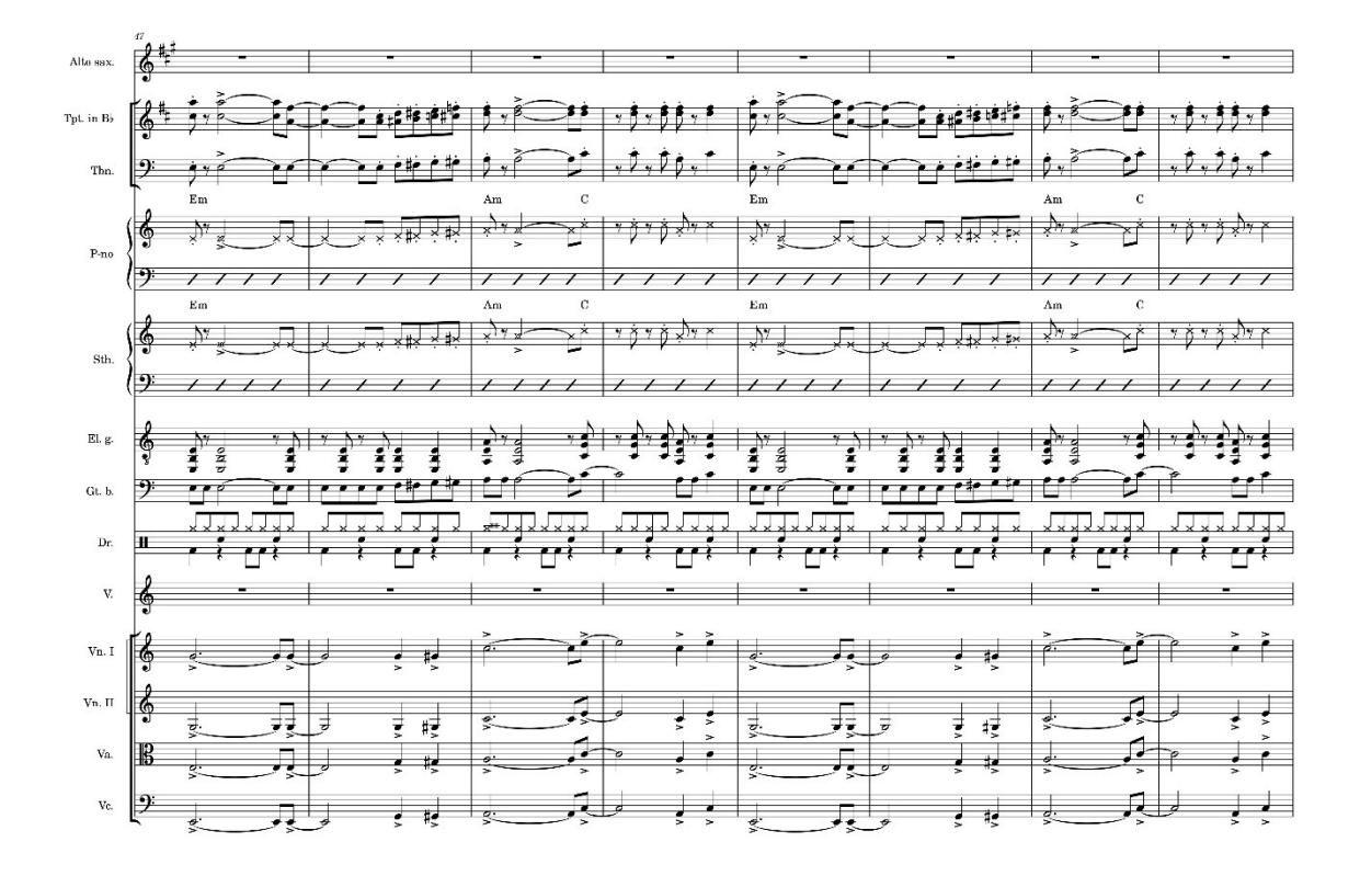
Fig.20. Visible structure of link B, in which the musical elements of the original recording, bars 47-54, have been preserved.