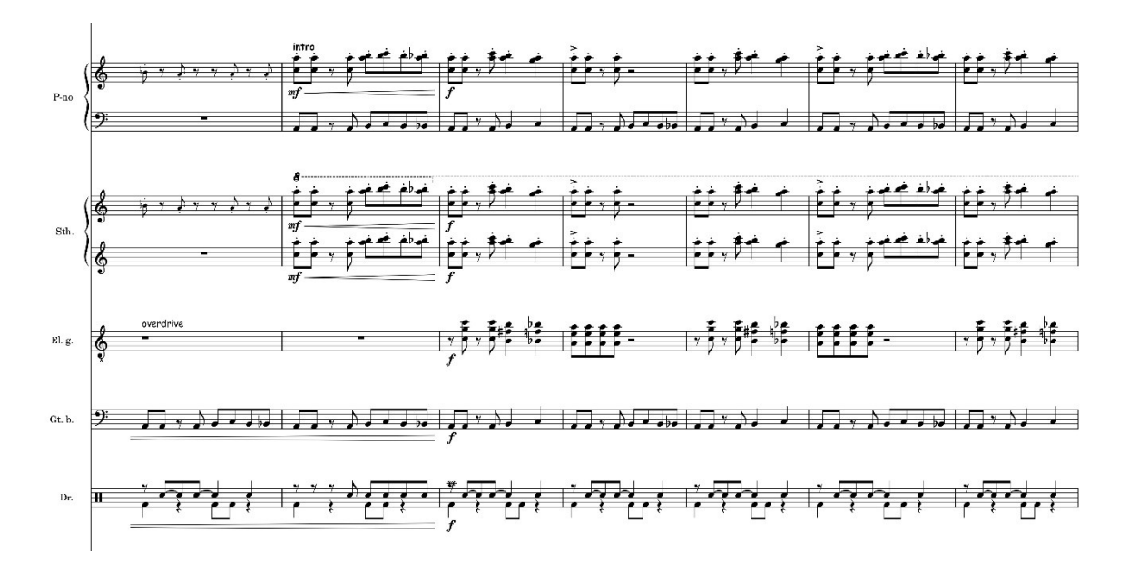
Fig.9. The riff and drum pattern shown, bars 15-21.

The connecting element consists of short rhythmic and melodic figures. The choral part appears for the first time in a given piece. In the context of the semantic layer, the parlando of the choir as the voice of the people, the community shown in the second stanza, emphasizes the importance of the verbal text. The choral part also highlights the formal contrast of the song in the choruses (the dominant structure is staccato in the verses and legato in the chorus) (fig. 10).