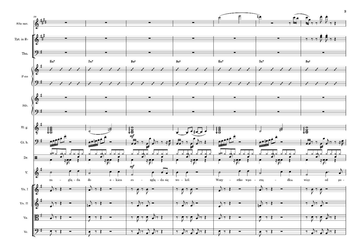
Fig. 2. Rhythmic and harmonic diagram referring to the original, bars 29-35.

The rhythmic and harmonic character only from a given moment analogously refers to the original rock song. A particular riff in the bass guitar and a distinct rhythmic pattern in the reggae style appear (Fig. 2).