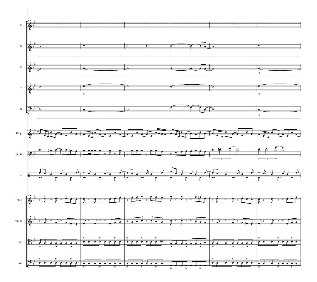
Fig.14. Shown choral part and new rhythmic structure in drums, bars 103-108.