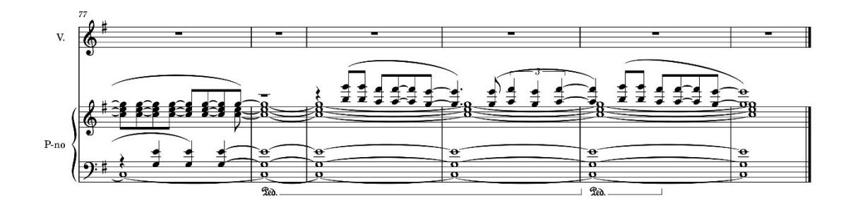
Fig.19. A characteristic motif of the Krakow spleen shown only in the last 4 bars of the rearranged song, bars 77-82.

The chamber nature of the piece in terms of the performers influences the primary treatment of the verbal text. The piano part in the chorus plays a constant, rhythmic pattern imitating a clock tick to emphasize the meaning of the word "waiting". The characteristic musical theme of the introduction of the original is shown at the end of the piece (fig. 19).