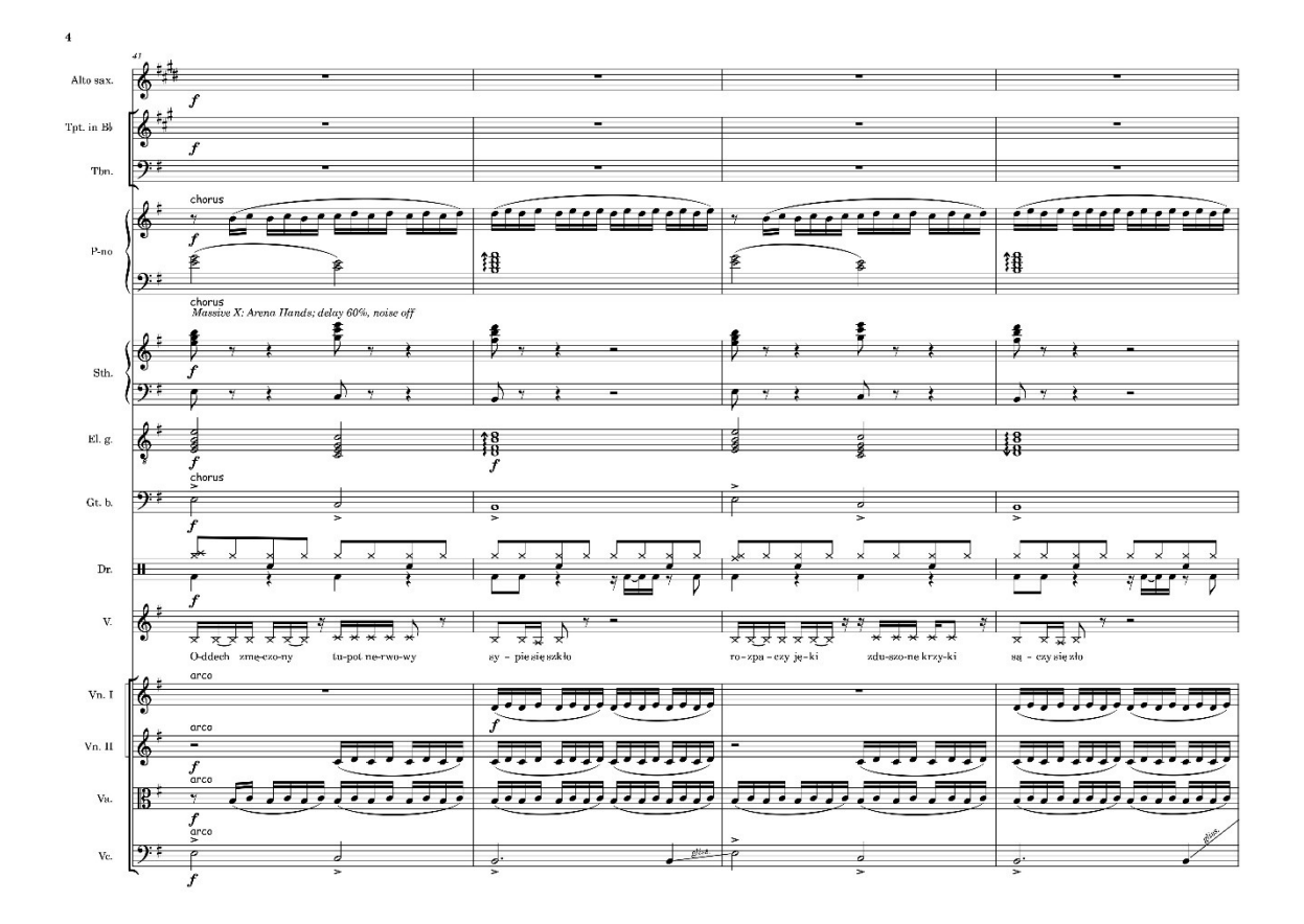
Fig.3. Minimalist structure in string instruments influencing the shaping of the drama of this musical part, bars 41-44 (source: own materials).

In this arrangement, the formal structure of the piece was changed. The stanza Sleep sleep calmly sleep/Breathe deeply/Dream pink dream is an element formulating the finale and at the same time shaping the climax of the piece. Originally it was presented before the second stanza, after which the stanzas were changed (3 \Leftrightarrow 4) . The above procedure has a completely different impact on the reception of the verbal text. Moreover, the lullaby accompaniment (a sixth-third motif played by the piano, pizzicato by the string instruments and sparingly played chords by the electric guitar) is a complete musical oxymoron compared to the sound material discussed so far. A lullaby as a musical piece is created out of the need for closeness, it accompanies a person in the first stage of life, despite its simplicity, it is often an extremely emotional creation (Fig. 4.)