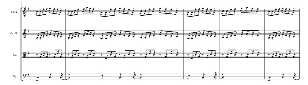
Fig.21. The musical block of a string quartet, which is exposed in bars 25-32, due to pauses in the brass instruments.

The musical form has a block structure - separate musical blocks that correlate with each other are independent and are also shown separately (Fig. 21 and 22).