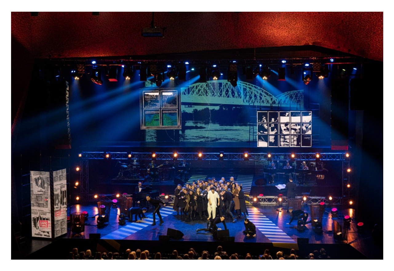
Photo 1. Premiere of the musical show Nocny Patrol

The concept of a musical spectacle has not been clearly defined. There is only a general definition of a show - according to the Dictionary of the Polish Language, it is a "performance", a performance; an event, a scene taking place in front of the audience"<sup>57</sup>. This nomenclature can undoubtedly be adopted in the "Night Patrol" project.