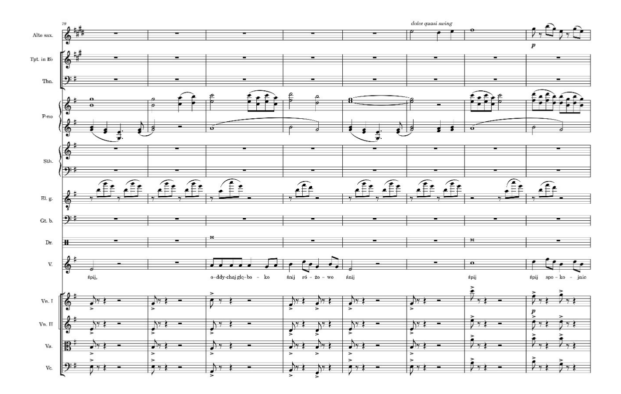
Fig.4. A lullaby musical layer showing the refrain in contrast to the previous structure, bars 79-86.

The idyllic content of a lullaby may subconsciously influence the perception of the verbal and musical content. The finale of the piece begins with the entry of the cello in bar 91 and the repetition of the initial introductory motif, creating a ring composition. The final part brings together musical motifs that appear throughout the entire piece, sometimes interacting dissonantly with each other.