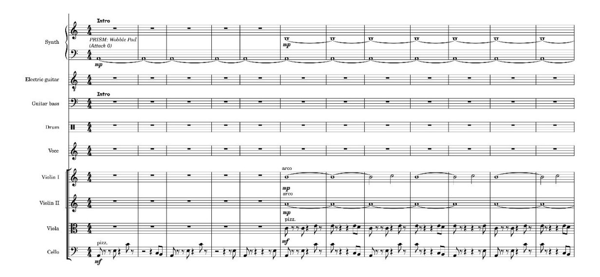
Fig.7. The introduction of the piece is shaped by string instruments in contrasting pizzicato (viola and cello) and legato (violins I and II) articulation, bars 1-12.

The dramatic, restless tone is interrupted in bar 48 of the tutti, in which the instrumental chorus is introduced with the original, extremely characteristic electric guitar solo in dialogue with the remaining instruments (fig. 8).