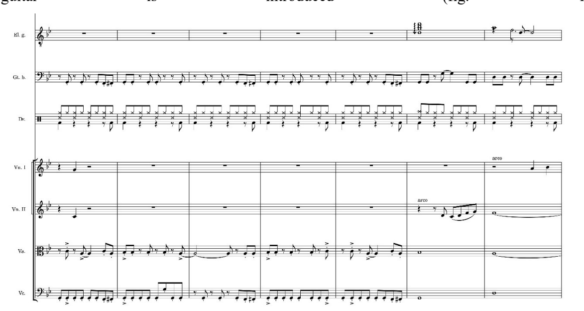
Fig.13. Articulatory change in the stanza – beginning of bar 39; bars 34-40.

The rhythmic pattern of the drums and the musical motifs of the original have been preserved, shown in the soprano saxophone and electric guitar parts. The mentioned rhythmic pulsation, already visible in the introduction, is supported by an accented ostinato played by the cello and viola. This course continues in the first part of the first stanzaand contrasts with the second part of the first verse played legato, and new musical material played by an electric guitar is introduced (fig. 13).