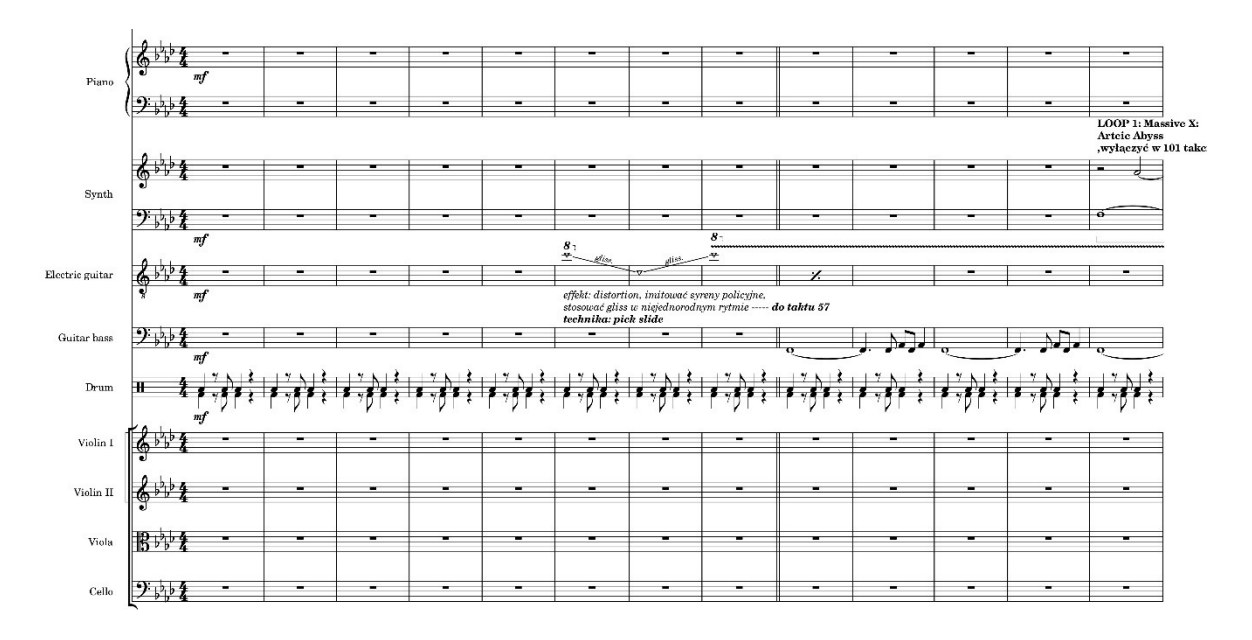
Fig.11. The beginning of the piece, the introduction of the electric guitar and performance annotations - i.e. detailing the above-described playing techniques, bars 1-13.

The above song is the only instrumental included in the music album "Nocny Patrol" by Maanamu. The band has often released instrumental songs ("Miłość jest wonderful" (Maanam album), "Kowboje OK", "Przerwa na cigarettea" (Mental Cut)). The musical expression and the title refer to the context of martial law. In a given arrangement, just like in the original, a symbolic connotation is achieved through the use of specific musical means: percussion ostinato and bass guitar giving expressiveness and at the same time emanating a certain sense of mystery. Despite the lack of verbal lyrics, "Polish Streets" is an instrumental composition that allows for full emotional impact. It is indeed an illustrative composition - the use of various techniques in the electric guitar part, such as: