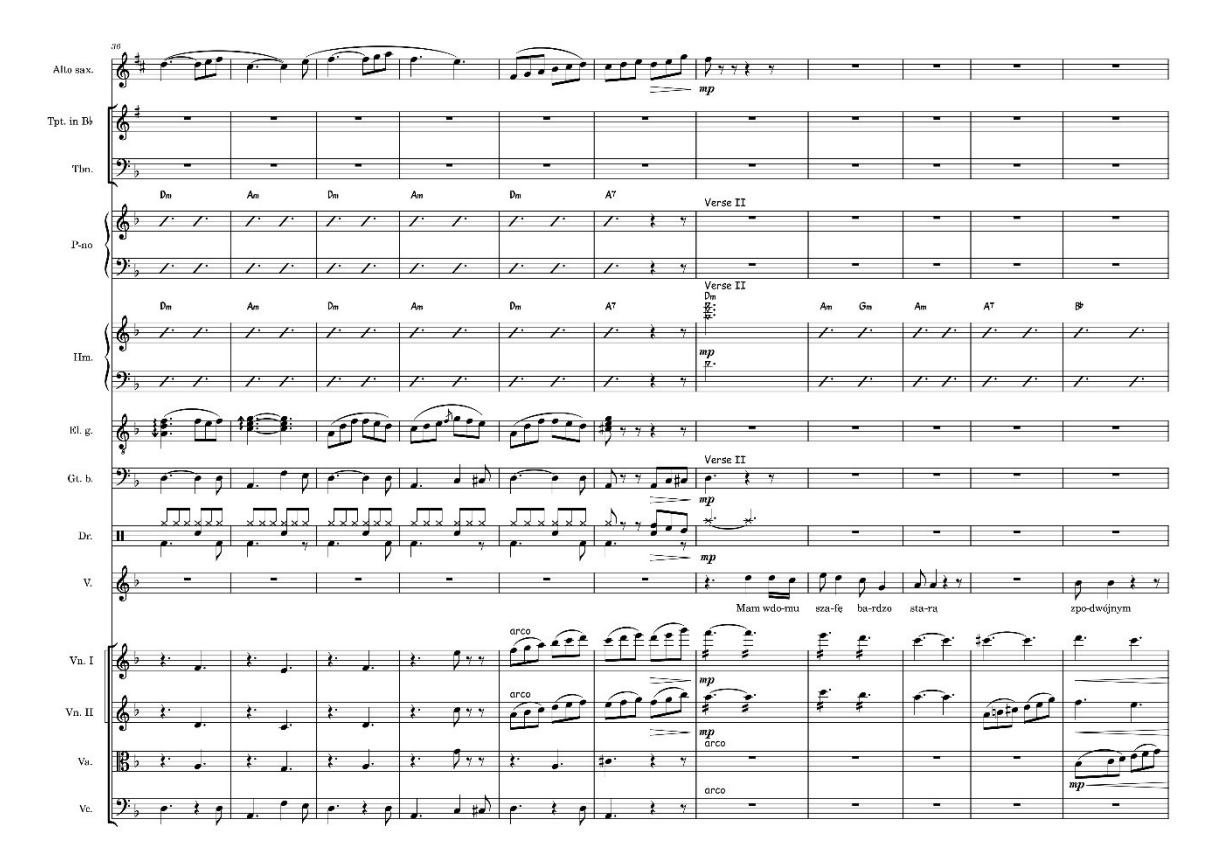
Fig.5. There is a visible temporary exclusion of the pattern of the rhythm section and the piano, leaving only the string instruments consistently following bars 36-46.

String instruments entering one after another in mezzo piano dynamics, along with the thickening of the texture, are visible towards the re-introduction of the rhythm section, electric guitar and alto saxophone in mezzo forte dynamics (bar 49). When describing the musical semantics of this structure (i.e. 42-57 bars), one should pay attention to the consonance of the sound, as in the case of the melody played by the alto saxophone - given patterns show a certain clarity, emotionality, hope. The verbal and musical contrast is also visible: