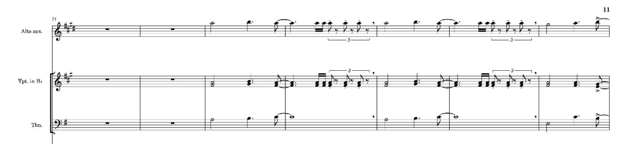
Fig.22. A musical block for a brass quartet, which harmonizes with the above musical material contained in the string quartet part, bars 12-20.

The form and drama of the piece are shaped by introducing individual sections of instruments. It also influences the natural flow and dynamics of the piece. The characteristic musical theme of the introduction of the original appears from bar 57. It is rhythmically transformed in the brass part by adding smaller rhythmic values in staccato articulation (fig. 23).