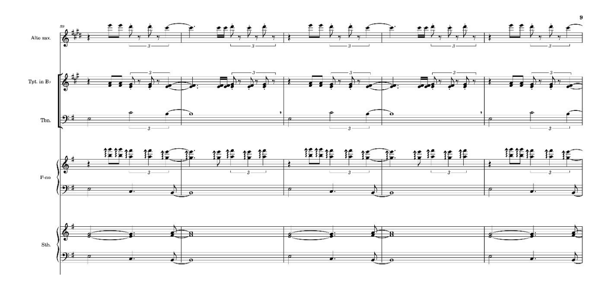
Fig.23. Presenting the recognizable musical theme of the Krakow spleen in the piano part and in the wind instruments, but by introducing changes in the rhythm of bars 59-63 (source: own materials).

The inclusion of choral voices from bar 72 to measure 4i influences and announces the culmination of the piece, which will be shown in the final choruses, i.e. from bar 81. The character of the finale of the Night Patrol musical spectacle is strictly intensified by the accumulation of emotions and increased musical tension. The use of various musical means, such as a gradual increase in dynamics throughout the entire piece or the successively expanded ambitus of the choral voices and, above all, the complete tutti, which was shown for the first time - all this clearly closes the musical multi-layers of this arrangement of the Night Patrol.