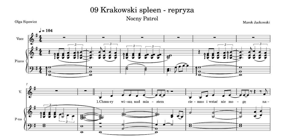
Fig.17. Visible inversion in the piano part of the musical theme from the original version of the song, bars 1-8(12).

The introduction of the song uses an inversion of the musical theme of the original introduction (Fig. 17).