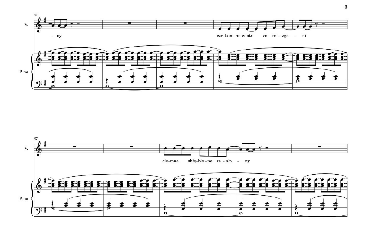
Fig.18. An additional two-bar pause in the vocal part expands the formal material of the piece and gives the words special meaning to bars 62-71.

The chamber nature of the piece in terms of the performers influences the primary treatment of the verbal text. The piano part in the chorus plays a constant, rhythmic pattern imitating a clock tick to emphasize the meaning of the word "waiting". The characteristic musical theme of the introduction of the original is shown at the end of the piece (fig. 19).