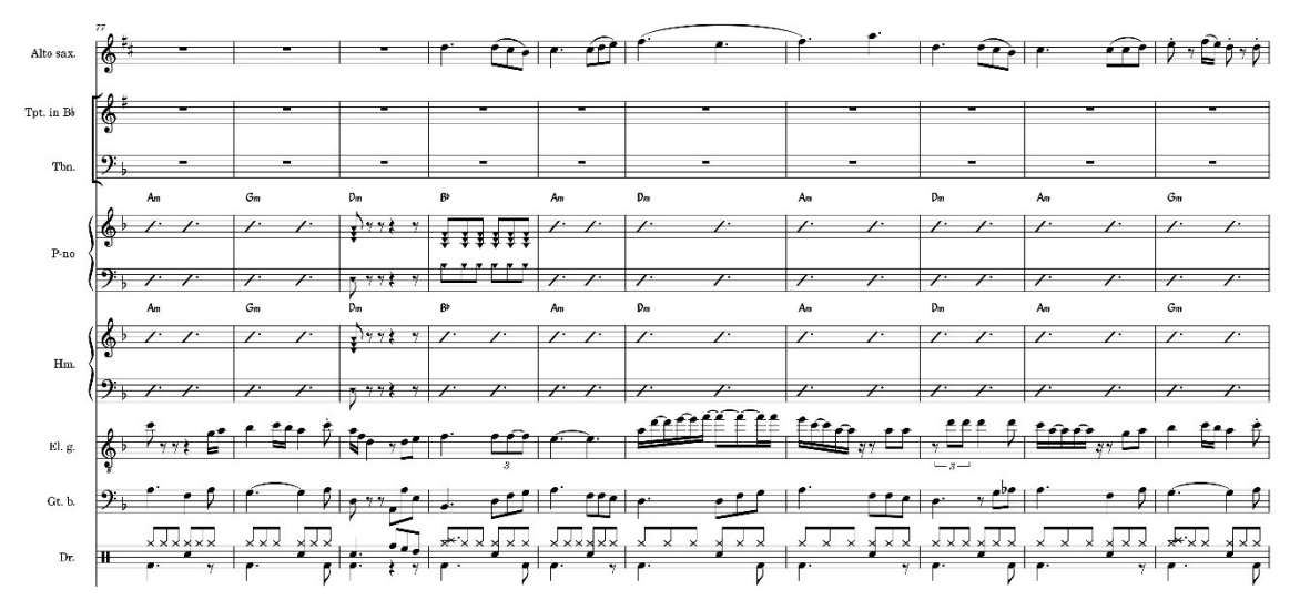
Fig.6. A musical fragment presenting the dialogue between the new counterpoint in the alto saxophone part and the original melody of the electric guitar and bass guitar, bars 77-86.

In measure 104, the modulation of the current key of D minor to F sharp minor begins, repeating the refrain again in fortissimo dynamics along with tutti. The repeated chorus also serves as the ending of the song.